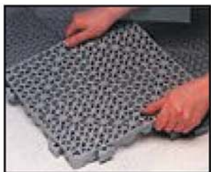
TURTLE TILES™ IN CABINETS

Equipped with 20' of heavy duty nylon strap. Eliminates the need to secure straps, come-a-longs and ropes. Can be used to secure one or two toilets on carrier or to secure carrier when in the 'up' position.