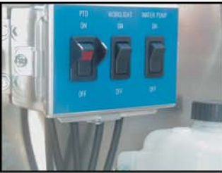
REMOTE CONTROL PANEL

Inlet hose on both sides rather than the driver's side only. Second hose reel complete PumpTec "Crap-Shooter" 1200 PSI pressure washer 2"X50' vacuum hose in place of standard Other pump options Delivery service