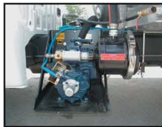
JUROP PN58 (230 CFM) VACUUM SYSTEM

Switch 1: Engages Hot Shift PTO & sets engine RPM to drive pump at correct speed. System also prevents the truck from being driven with PTO engaged. Switch 2: Controls the work lights Switch 3: Operates the Burks DC-10 water pump