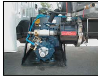
JUROP PN58 (230 CFM) VACUUM SYSTEM

Switch 1: Engages Hot Shift PTO & sets engine RPM to drive pump at correct speed. System also prevents the truck from being driven with PTO engaged. Switch 2: Controls the work lights Switch 3: Operates the Burks DC-10 water pump