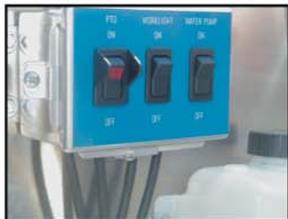
REMOTE CONTROL PANEL

Switch 1: Engages Hot Shift PTO & sets engine RPM to drive pump at correct speed. System also prevents the truck from being driven with PTO engaged. Switch 2: Controls the work lights Switch 3: Operates the Burks DC-10 water pump